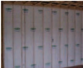
BIBS Insulating System

Our homes are tested and inspected by an independent Home Energy Rater to ensure that your new home meets ENERGY STAR's strict guidelines for energy efficiency set by the U.S. Environmental Protection Agency (EPA).